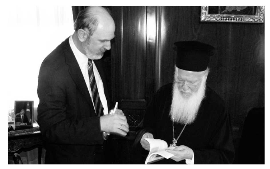
Third visit to the Ecumenical Patriarch in Istanbul.