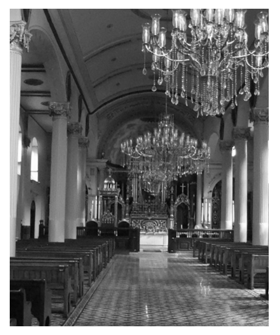
The Armenian Orthodox Patriarch's Church in Istanbul.